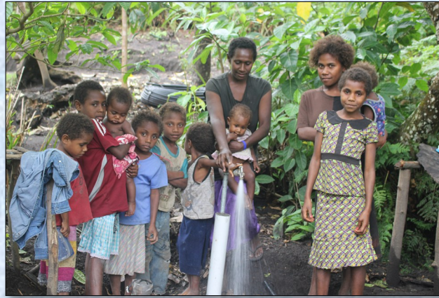
A climate change resilience project in Tanna.