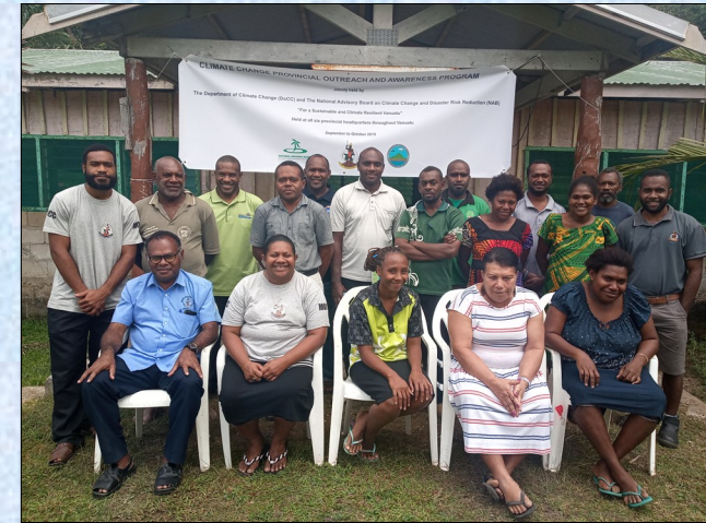
Climate Change Provincial Consultation in Sola, Torba Province.

The new Department of Climate Change under the Ministry of Climate Change and Natural Disasters was established in November 2018. The new office building was opened by the Minister of Climate Change in December 2018 along with the recruitment processes for the staffs of the Department. The Department was established in line with the Climate Change and Disaster Risk Reduction (CCDRR) Policy and the ACT that governs the operations of the National Advisory Board for Climate Change and Disaster Risk Reduction (NAB). It is indeed a milestone to celebrate the establishment of such a young but most needed department under the Ministry of Climate Change in Vanuatu.